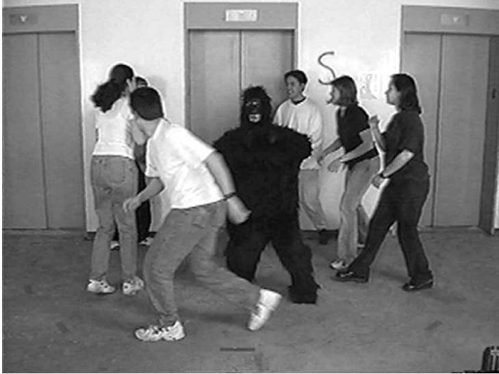
Figure 3. A single frame from an additional experimental condition in which the gorilla stopped in the middle of the display, turned to face the camera, thumped its chest, and then continued walking across the field of view. Subjects performed the Easy monitoring task while attending to the White team, and the noticing rate was similar to that in the corresponding condition with the standard (shorter) Opaque/Gorilla event.

Twelve new observers (6) watched this video while attending to the White team and engaging in the Easy monitoring task; only 50% noticed the event. This is roughly the same as the percentage that noticed the normal Opaque/Gorilla-walking event (42%) under the same task conditions.