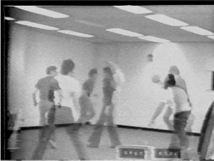
Figure 1. A single frame captured from a late-generation video of the umbrella-woman sequence used by Neisser and colleagues (eg Neisser 1979). The woman is in the center of the image and her umbrella is white.

In subsequent studies of selective looking, Neisser and his colleagues used this 'basketball-game' task [see Neisser (1979) for a description of several different versions]. In the most famous demonstration, observers attend to one team of players, pressing a key whenever one of them makes a pass, while ignoring the actions of the other team. After about 30 s, a woman carrying an open umbrella walks across the screen (this video was also superimposed on the others so all three events were partially transparent; see figure 1). She is visible for approximately 4 s before walking off the far end of the screen. The games then continue for another 25 s before the tape is stopped. Of twenty-eight naive observers, only six reported the presence of the umbrella woman, even when questioned directly after the task (Neisser and Dube, cited in Neisser 1979). Interestingly, when subjects had practice performing the task on two similar trials before the trial with the unexpected umbrella woman, 48% noticed her. When subjects just watched the screen and did not perform any task, they always noticed the umbrella woman, a result consistent with the inattentional-blindness findings reviewed earlier (and with work on saccade-contingent changes; see Grimes 1996; McConkie and Zola 1979).